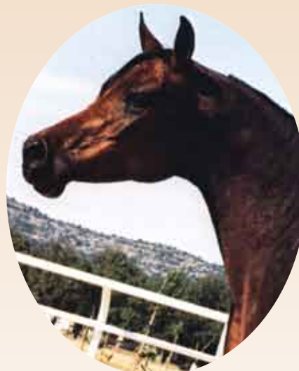
Nagliah 1972 bay mare (Ibn Hafiza x Nabilahh). She was a lovely mare with large dark eyes. She is another outcross element in the pedigree of Thee Desperado also having no Nazeer or Moniet El Nefous breeding. She is the tail female line of Thee Desperado and he shows much of her facial character and rich mahogany bay color.