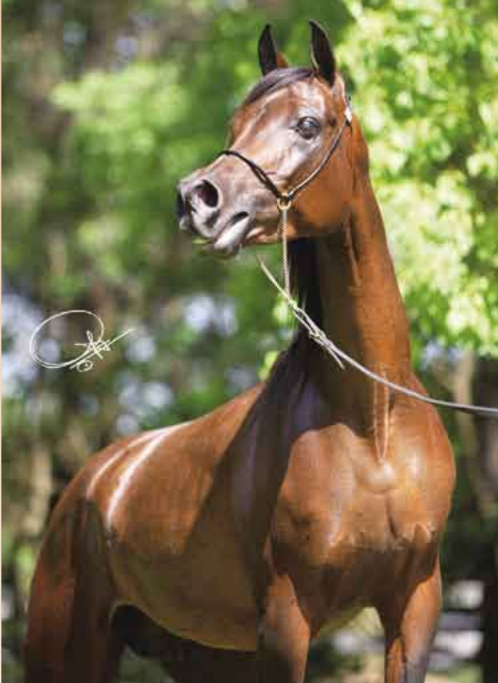
Thee Cappuccino 1994 bay mare (x Jubilllee)