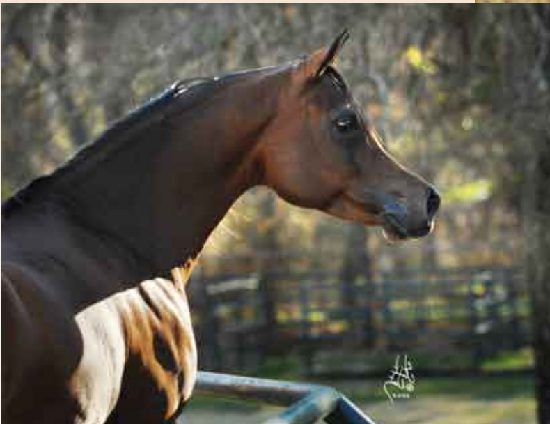
The Sequel RCA 2001 bay stallion (x La Marsala)