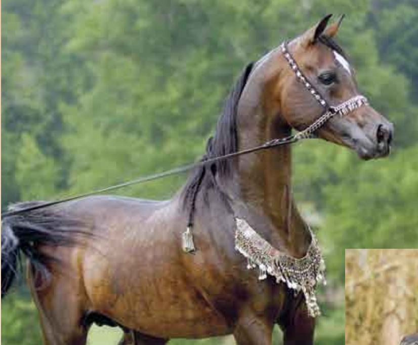
Botswana 1998 bay stallion (x The Minuet)