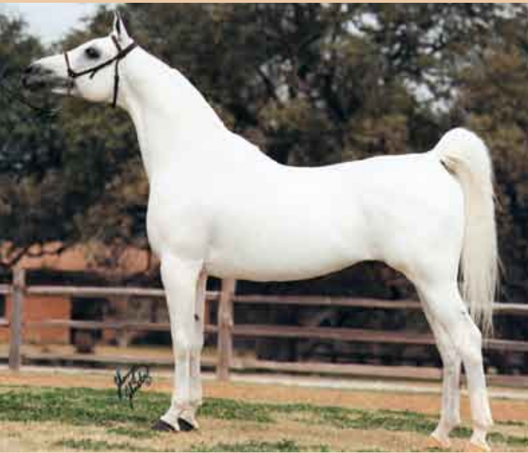
The Egyptian Prince 1967 grey stallion (Morafic x Bint Mona) another legend in Egyptian breeding, he is the maternal grandsire of Thee Desperado.

quality. But that did not impress AK Amiri Asmarr one bit because she wanted nothing to do with motherhood and did not want this little bay colt anywhere near her. However the boldness of this youngster was to foretell of a "Desperado" who would make a name for himself no matter what his mother thought.