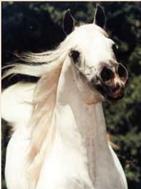
Ruminaja Ali 1976 grey stallion (Shaikh Al Badi x Bint Magidaa by Khofo) Multi U.S. National championship winner and an international patriarch in Arabian breeding. He is the paternal grandsire of Thee Desperado.