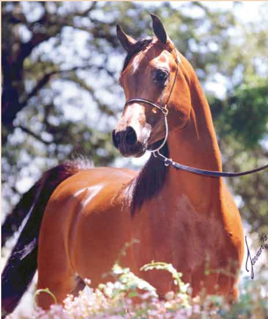
BJ Thee Mustafa 1993 bay stallion (x Khalili El Bahar)

lines to Nazeer in their pedigree. This is represented by the non-Nazeer mares Bakria, grand dam of The Minstril, and Asmarr grand dam of Thee Desperado. In each of these mares are multiple lines to the Rabdan El Azrak blood, noted for producing intelligent, athletic horses with long graceful necks and powerful shoulders and also a source of the dark bay and black color. Asmarr carries ten crosses to Ibn Rabdan noted for excellent bodies and long shapely necks. Thus the recipe for Thee Desperado is an amalgam of classic nobility and proud carriage with clean flat bone, fine skin, great beauty, beautifully balanced body, athletic talent from the Rabdan blood, all in a rich