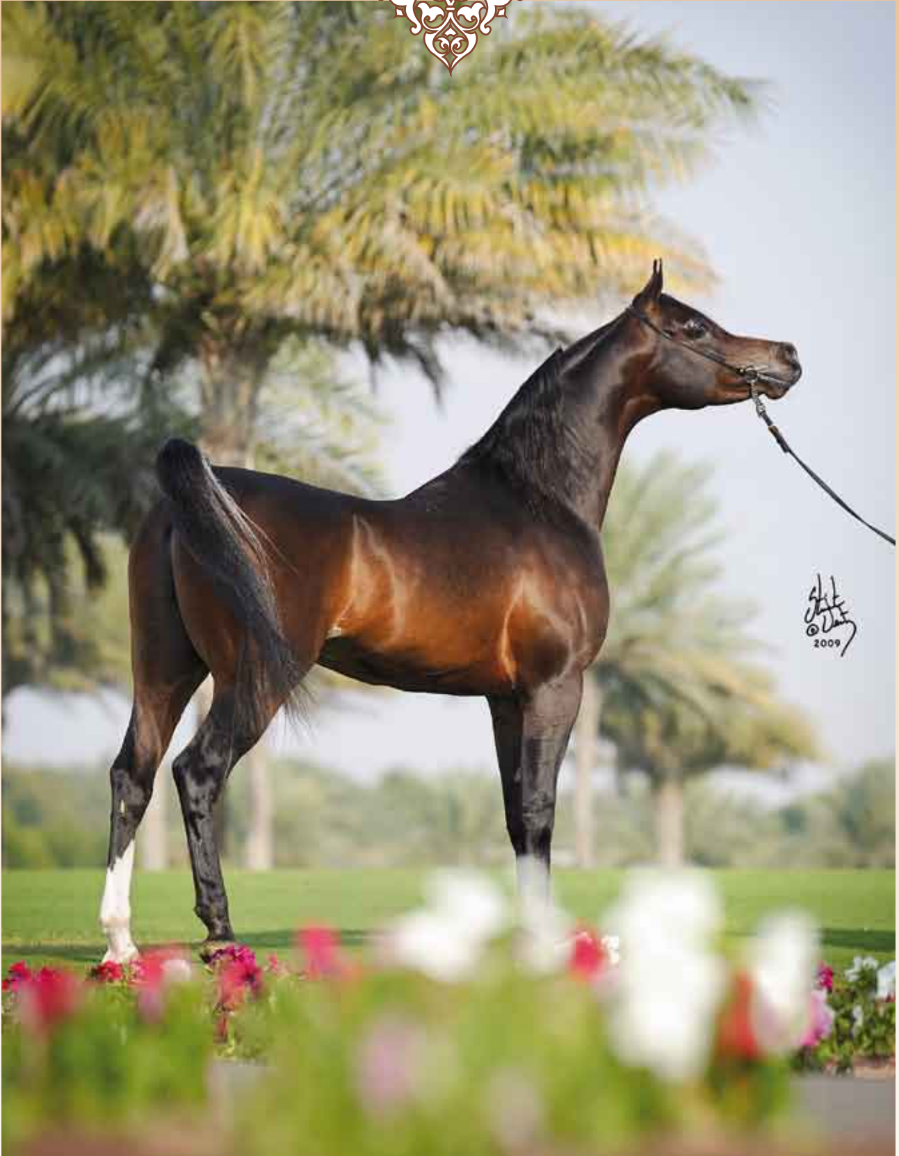
The celebrated stallion Royal Colours. He is double Thee Desperado being sired by True Colours, a son of Thee Desperado and out of Xtreme Wonder, a grand daughter of Thee Desperado.