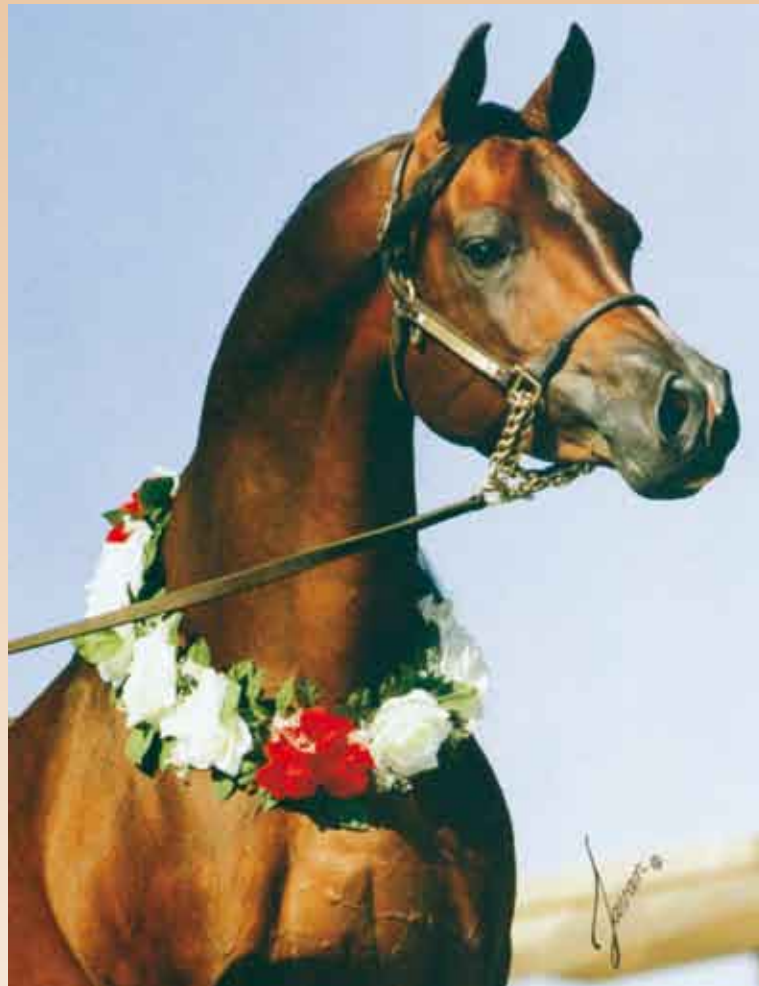
Thee Desperado, the charmer.

Certainly a strong flavor in the recipe of many Egyptian pedigrees today is the immortal stallion Morafic. He is the sire line of Thee Desperado but also is present three times in the pedigree. Morafic's effect is strong for generations, imparting nobility, elevated carriage and style of movement. He also imparts very fine skin and clean flat bone. Much of this of course comes also from