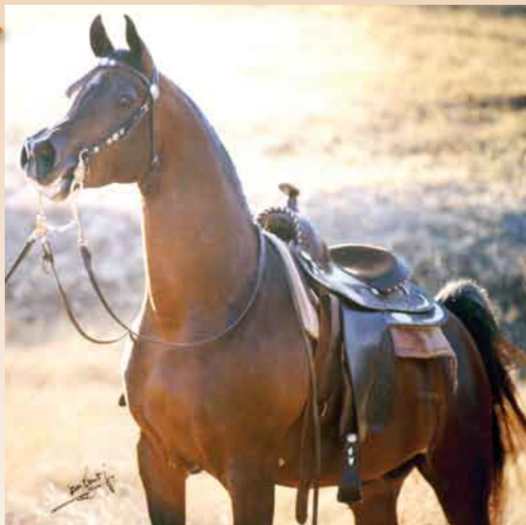
Thee Desperado 1989 bay stallion (The Minstril x AK Amiri Asmarr) with western saddle. Despite all the fanfare about him and his long halter-winning career, he enjoys being ridden around the farm.