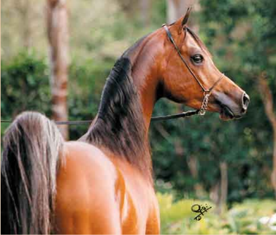
BB Thee Renegade 1994 bay stallion (x PH Safina)

deep Mahogany bay color. However the soul is in the eyes and Thee Desperado has this in great measure from his magnificent great grandmother, Nagliab, a splendid mare who you can see much of in his face. I saw her years ago and was charmed by her lovely eyes and beautiful facial proportions.