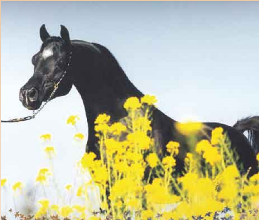
Windsprees Mirage 1996 black stallion (x GL Lady Mirage)