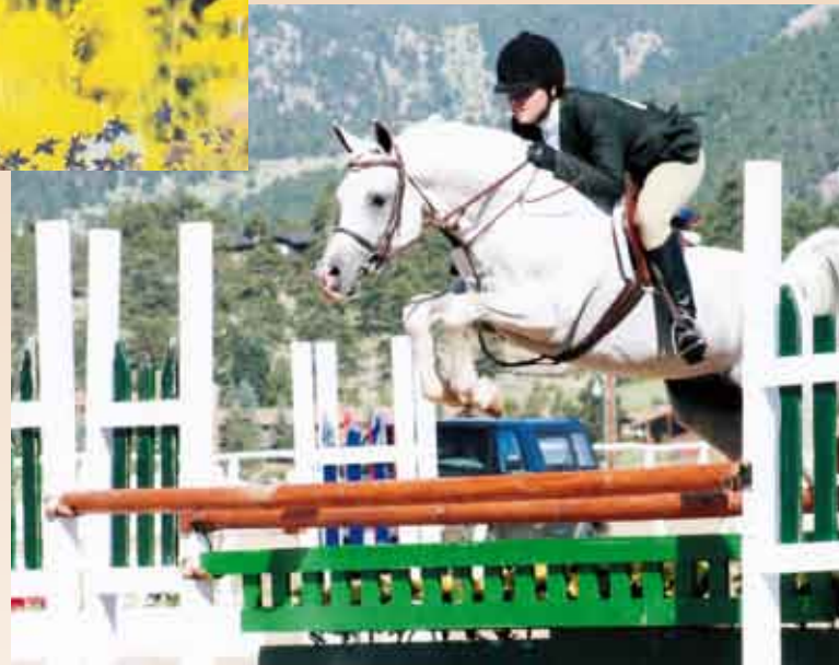
Egyptian Event Champion 3 year old Colt, twice Region 9 Reserve Champion.

Thee Asil 1997 chestnut stallion (x Alia Barakaa) U.S.