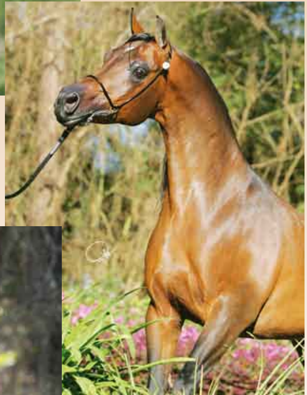
Insignia DeSha 2000 bay stallion (x Jubilllee)