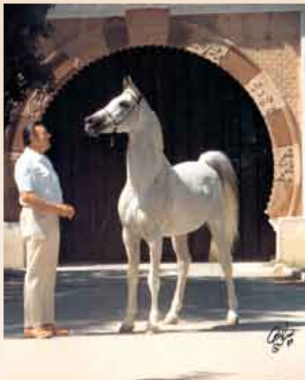
Zaghloul 1963 grey stallion (Gassir x Gharbawia) imported to the U.S. in 1970, he one of the outcross elements in Thee Desperado's pedigree being without Nazeer or Moniet El Nefous breeding. Shown here in old age at Gleannloch.