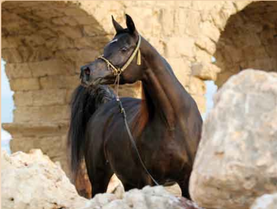
The Vision HG 1994 black mare (x Belle Staar)

Alixir) 2005 U.S. Egyptian Event Junior Champion and Scottsdale Top Ten, and Mirajh RCA (x Alixir) 2007 Champion colt at the Sakkara Nationals in Egypt.