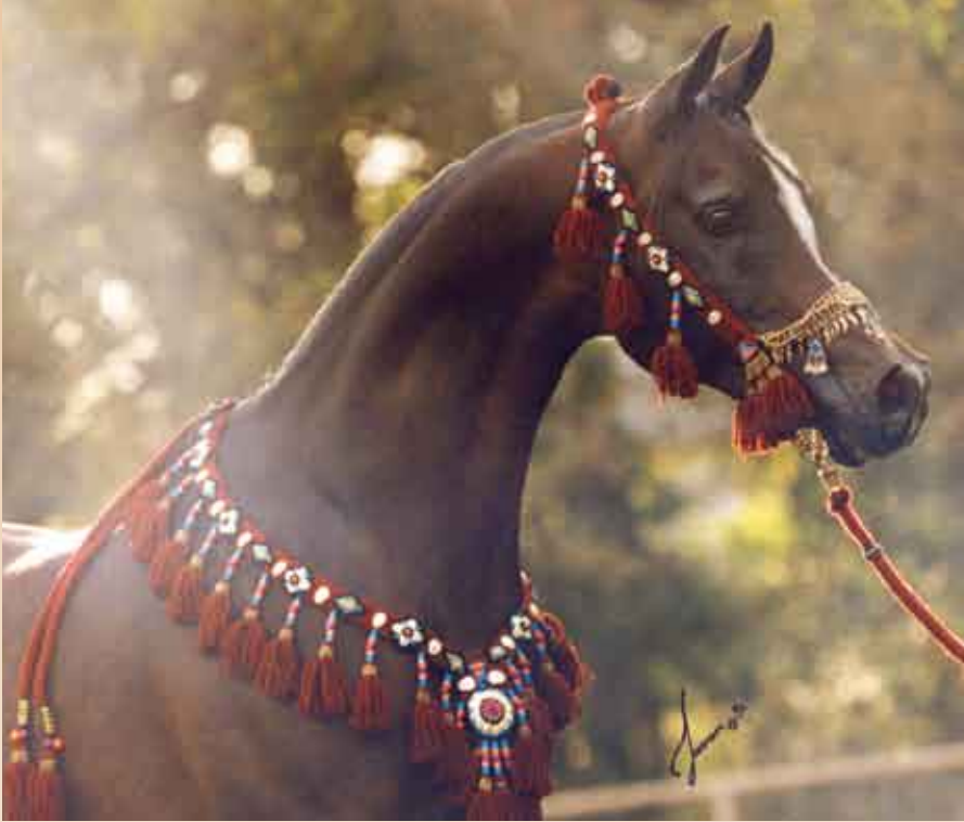
The Minstril (Ruminaja Ali x Bahila) 1984 bay stallion, U.S. Top Ten stallion and sire of Thee Desperado. The Minstril has sired 586 get thus far and is a leading sire of champions on five continents.