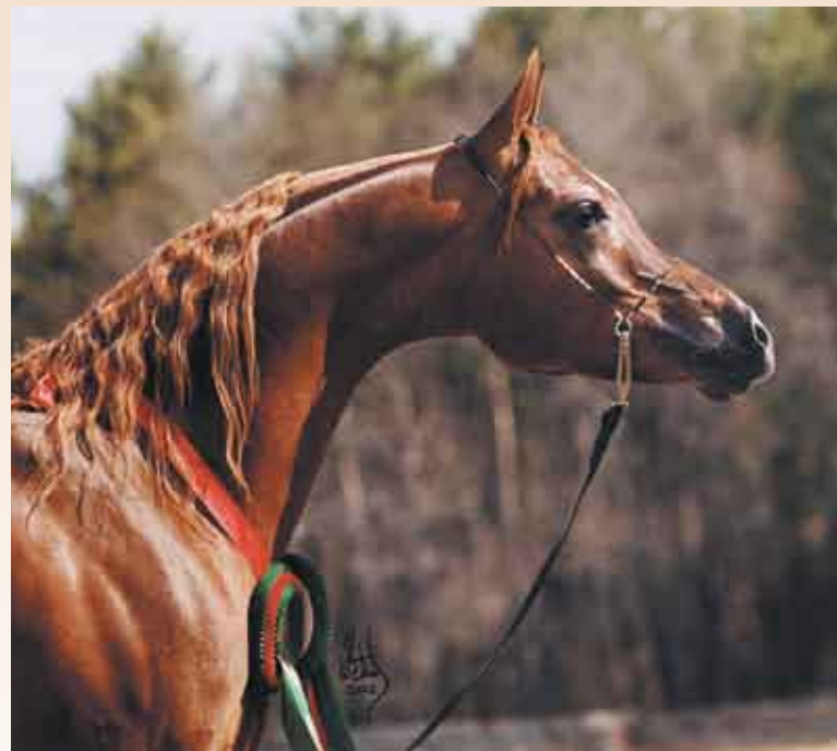
True Colours 1997 chestnut stallion (x Daheda)

Rhapsody In Black 1994 black mare (x Aliashahm RA) dam of numerous champions including Bellagio RCA (x