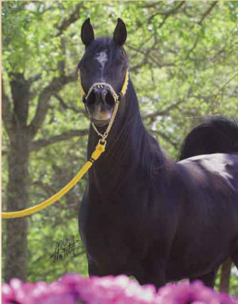
Queen Sheeba 1996 black mare (x MinstrilsGabriella)

Legion of Merit Winner, many times Sport Horse in Hand winner and champion and Regional Top 3 Dressage winner.