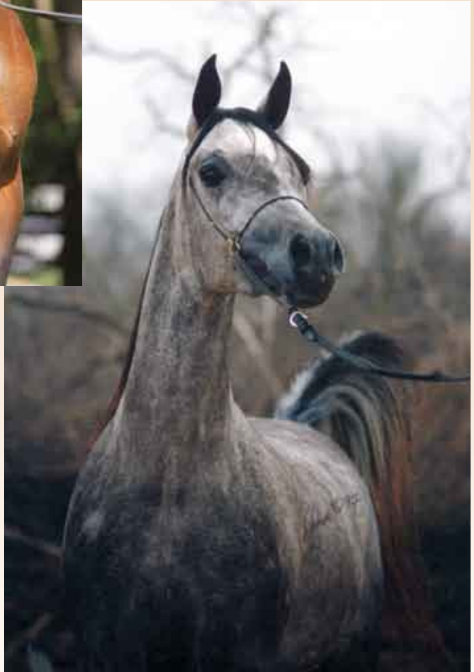
Deserree 1994 grey mare (x PH Maroufina)