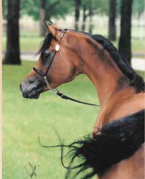
The Infidel 1995 bay stallion (x Bint Magidaa)