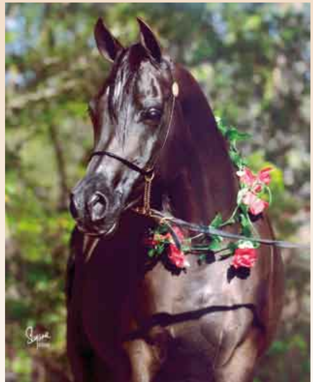
Rhapsody In Black 1994 black mare (x Aliashahm RA) Suzanne Sturgill photo.

Azadeh Ellena++ 1997 bay mare (x Eskada Ellena)