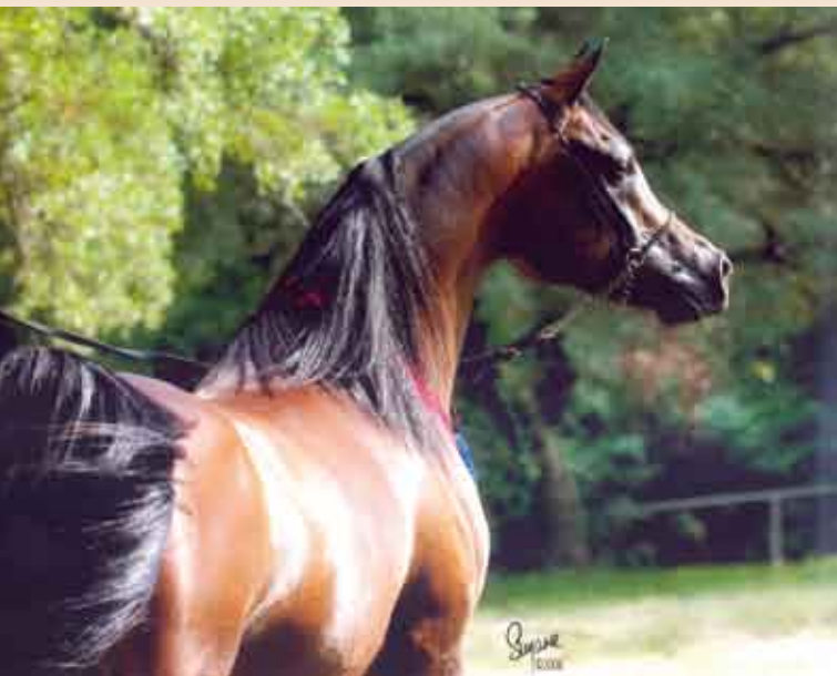
Pimlico RCA 1996 bay stallion (x Bint Bint Jamil)

Thee Gambler 1993 chestnut stallion (x Aliadaarra) Class A champion and Region Top Five Champion, U.S. National Top Ten AAO Champion, Canadian National Reserve AAO Champion, U.S. Egyptian Event Reserve