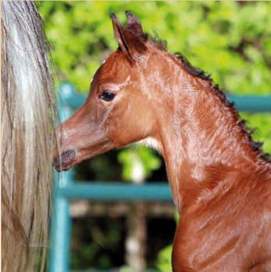
The look continues: Bella Asila RCA, 2008 filly (The Sequel RCA x Asila RCA).

had successful show careers prior to their exportation. My Silk Stocking (x Anastaziaa) is in the broodmare band of Al Zobair Stud in Sharjah, UAE. Deserree is owned by Shaikh Sultan Bint Mohammed Al Qasimi, Ruler of Sharjah. Of course, through the immense popularity of her impressive sons Al Lahab and Al Maraam, The Vision HG (Thee Desperado x Belle Staar) is a popular broodmare the stud of Arieli Arabians in Israel.