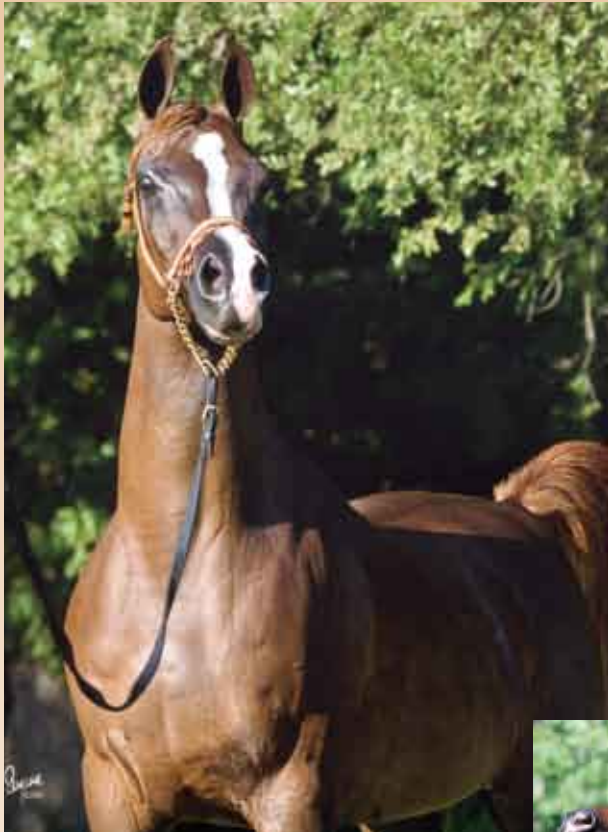
Sweet Eloise 1998 chestnut mare (x Kuhaylah Nitaya)

PR Desert Rose+ 1998 bay mare (x AK Nadara) Legion of Honor winner in both halter and performance, U.S. National AAO Champion Mare and Canadian National Top Ten Futurity and AAO Top Ten Mare as well as Class A champion.