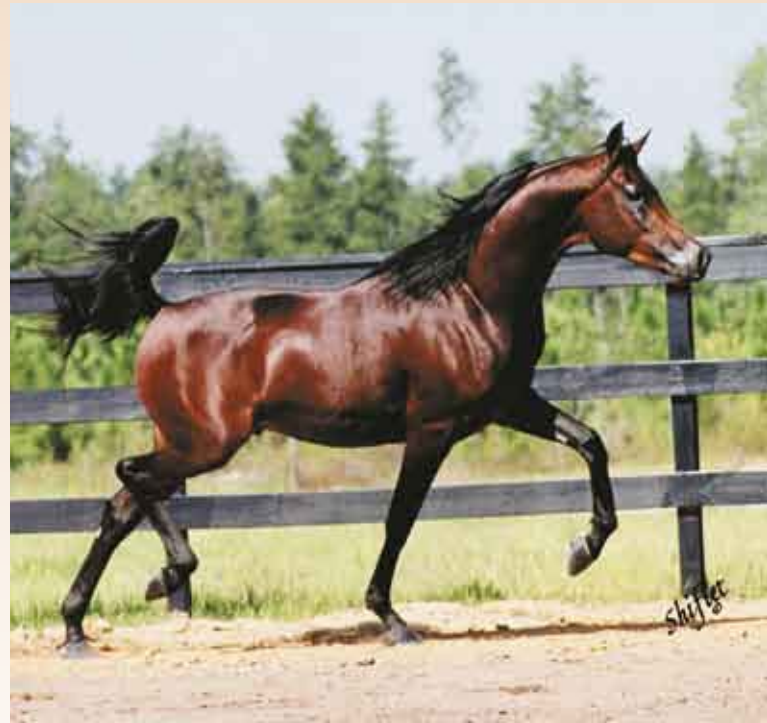
BG Maasai 1994 bay stallion (x DM Mimosa)

A brief review of some numbers and details indicates how popular he has become as a sire. Thee Desperado is the sire of 848 foals so far and he is only twenty years old this year. He has the distinction of being the sire of the most get of any straight Egyptian stallion ever. Of those 848 less than 12 percent are geldings so that means that an exceptionally high percentage of his get are of breeding potential. For eleven years in a row Thee Desperado was